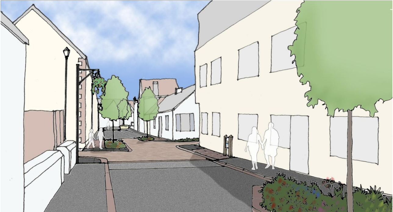
Southern view onto junction with Clairvale Road & Albert Street