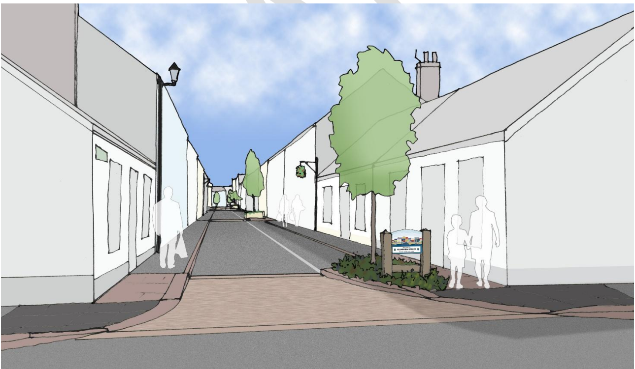
Northern entrance to Clearview Street