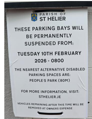
Pic 1: Site notice

In total, four Residents' Parking Zone (Cheapside Zone) spaces and one disabled parking space were removed. The melba blocks are intended as a temporary measure and, in response to concerns regarding their visual impact, are due to be replaced with planters. These are considered a more appropriate and visually acceptable alternative to bollards and will provide a clearer physical deterrent to parking while improving the overall streetscape.