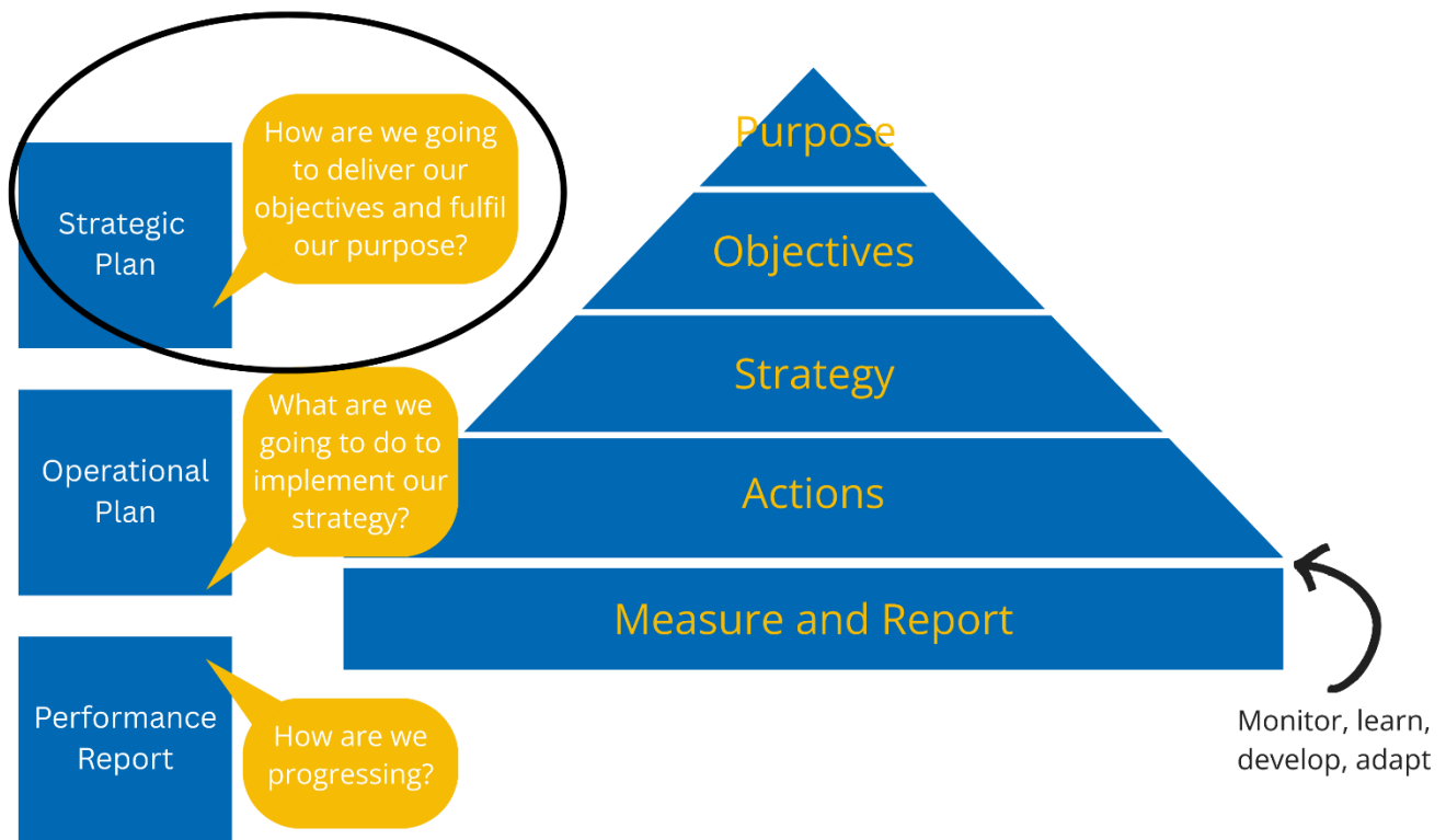
Figure 2 – planning and performance framework

Once agreed, it is important that the planning process cascades throughout the organisation, bringing a sense of common purpose and enabling everyone to see and understand their contribution to the Parish objectives. Figure 3 illustrates this.