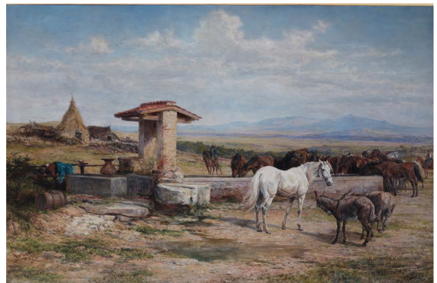
Charles H. Poingdestre A Well in the Roman Campagna Oil on Canvas, 1897 114 x 74cm

Poingdestre was born in St Helier in 1829 but lived in Italy for thirty years, painting pictures of local landscapes and people. His technique, typical of topographical paintings of the time, gives an aerial perspective by painting warm colours in the foreground and cool lilac in the far distance.