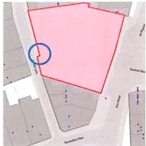
Blue circle indicates the approximate location of private footway in Garden Lane