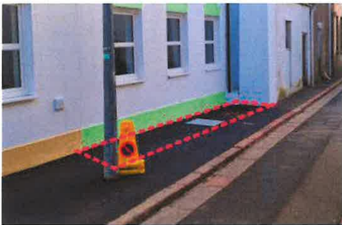
Area of private footway being offered to the Parish shown dotted (approx. 7.75 sq.m. (83.42 sq.ft.))