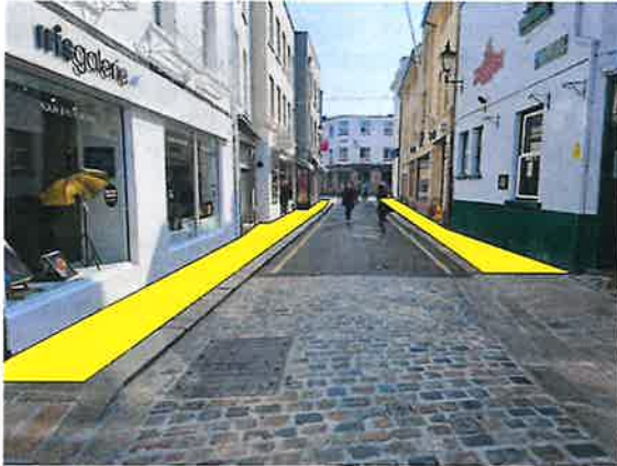
PIC 1: Yellow highlighted areas would be done in granite from Parish stocks

The extent of the areas is shown in the pic below.