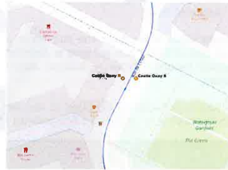
The bus stops placed opposite each other will be serviced by the Town Link Service 20.