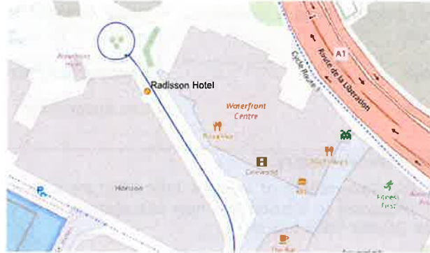
The bus stop placed at this location will be known as "Radisson Hotel" and be serviced by the Town Link Service 20.