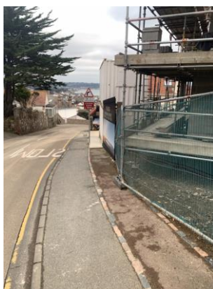
Photo on Tower Road