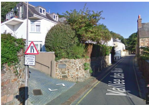
Photo on Le Vallée des Vaux