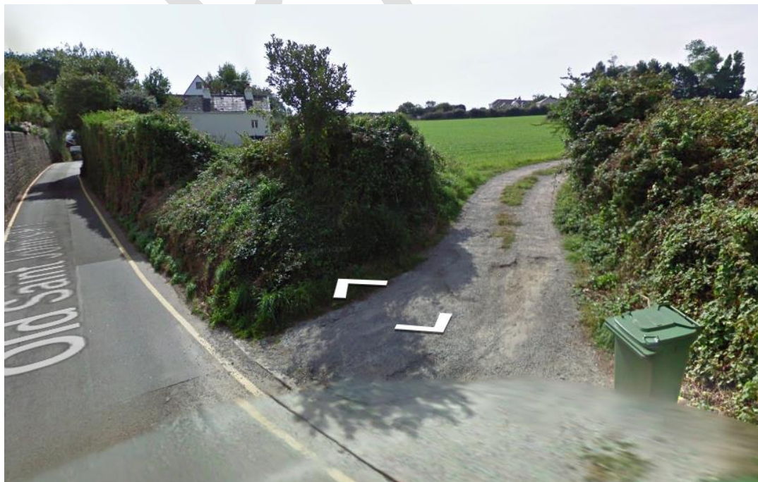
Photograph: South view on section of land that will be ceded to the Parish.

Plan: Approximately 60 sq. m./ 646 sq. ft. land for the purpose of creating a new 1.5m wide public footpath for approximately 40m highlighted in yellow on the above plan.