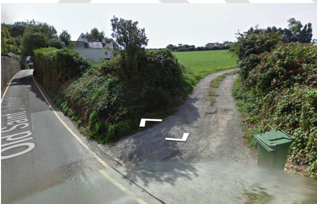
Photo on Old St John's Road