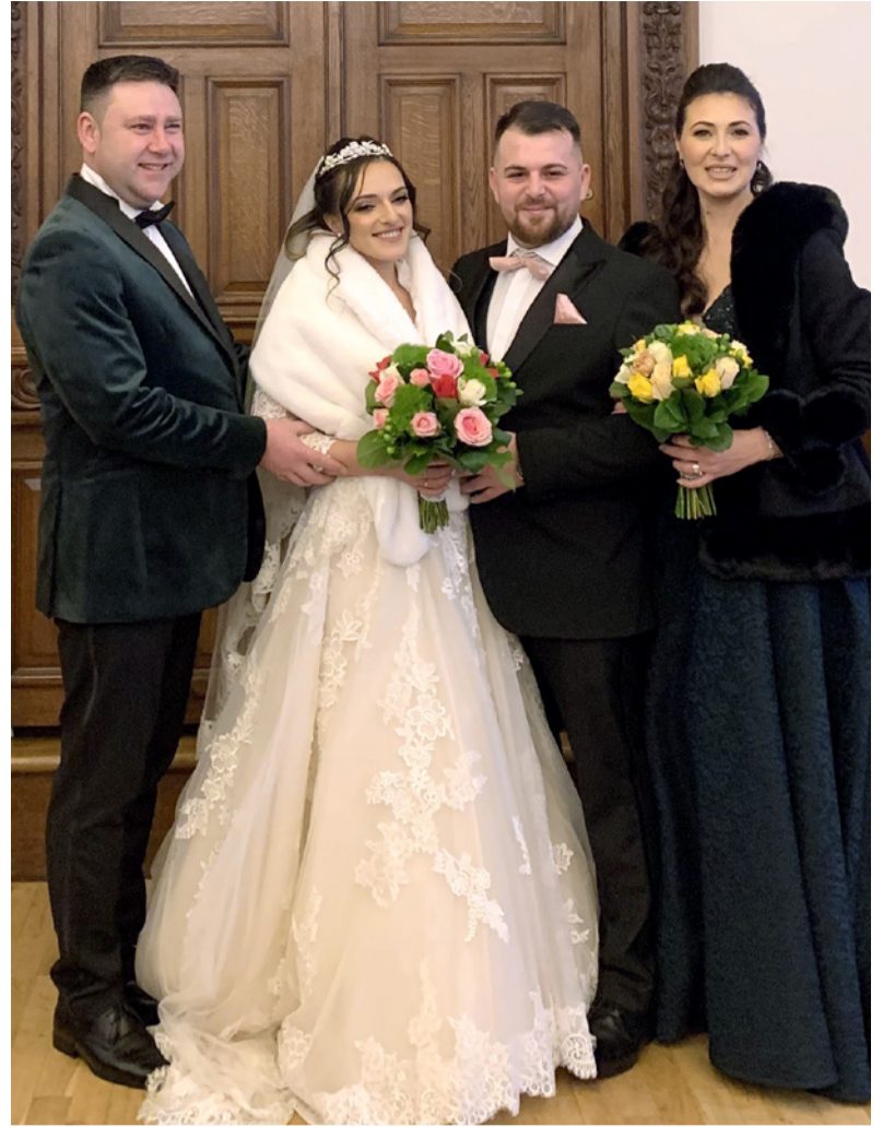
The Old Magistrate's Court continues to be used for a wide variety of events such as weddings: this Romanian couple tied the knot in the former courtroom recently.

Free entry and refreshments, with a retiring collection in aid of the Bailiff's Appeal.