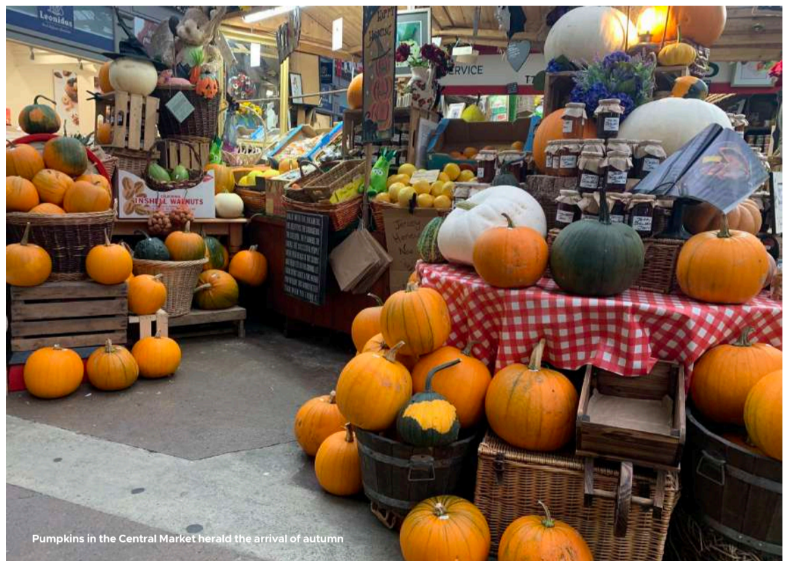
Pumpkins in the Central Market herald the arrival of autumn