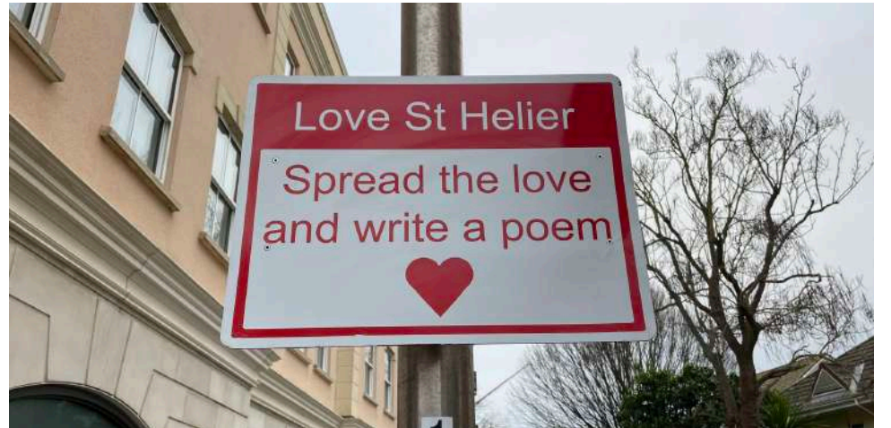
Below: Caption: Although ongoing Covid restrictions prevented the Parish's St Valentine's Ball from taking place this month, the quirky signs have gone up around town and will hopefully put a smile on people's faces.